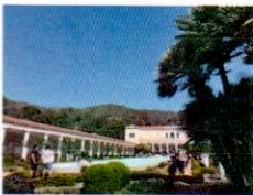
Courtyard of the Getty Villa

In my Building an Empire: A History of Rome course this semester, honors students had several opportunities to enrich their understanding of Roman history by going “beyond the textbook.” An optional field trip to the Getty Villa in Malibu early in the semester exposed students to this world-class museum just a couple hours’ drive from campus, with its internationally acclaimed collection of Greek and Roman antiquities, all housed in a stunning replica of a first-century villa excavated at Herculaneum on the Bay of Naples—a town that, like Pompeii, was buried in the eruption of Mount Vesuvius in 79 CE.