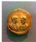
Medallion of Emperor Maximianus and Caesar Constantius, late 3 rd cent.

In addition, after reading a scholarly article on Roman women and an ancient satire on the same topic (by Juvenal), two teams of students developed their own round of reverse “Roman Jeopardy,” with questions about Roman women and the family presented to the opposing team, an approach that may help them remember at least some of the chief features of life for women in the Roman world.