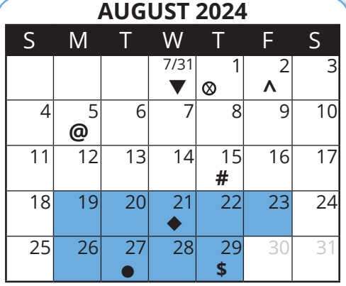
Pay Period: July 31 - August 29 (22 days)